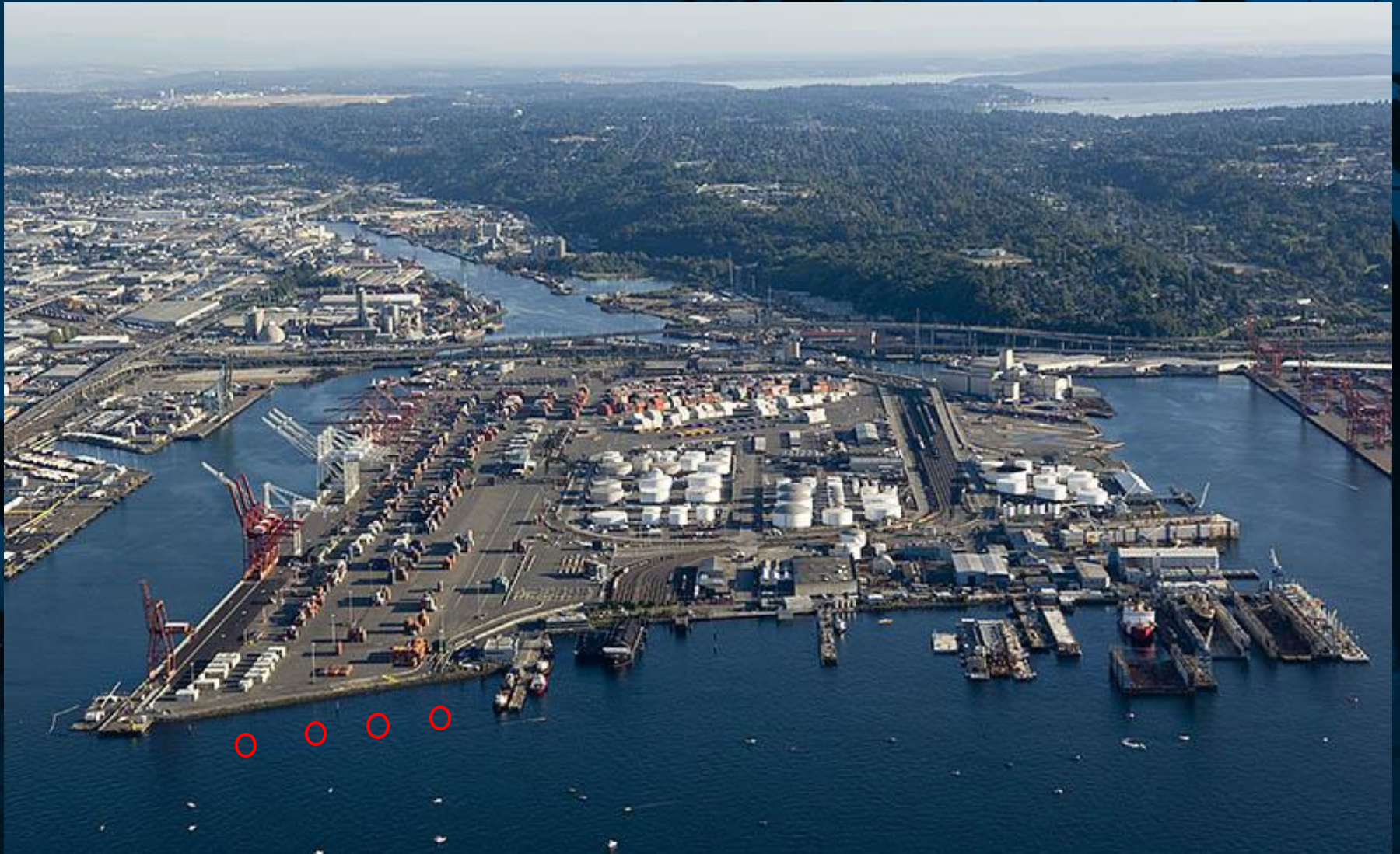
North Harbor Island Mooring Dolphins